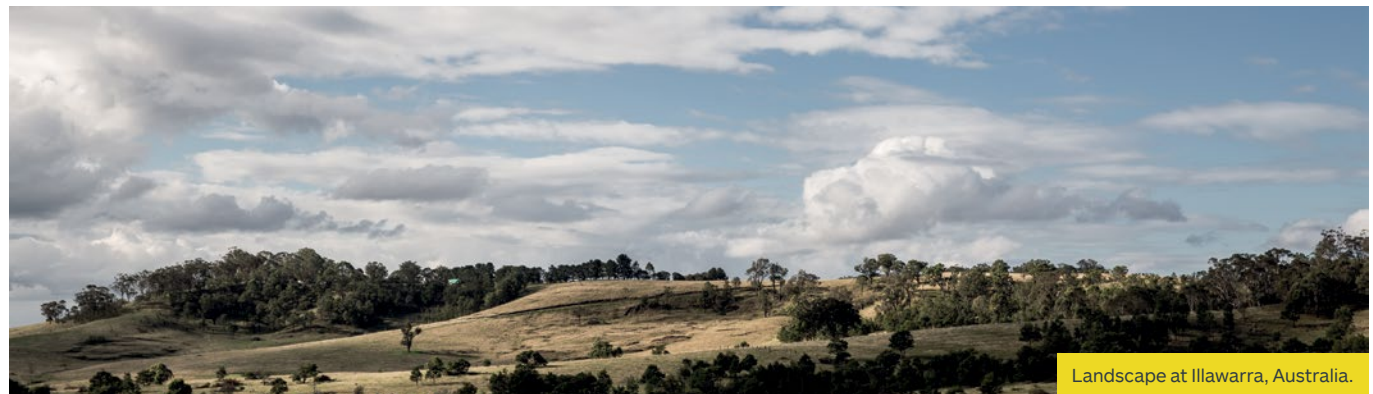
Landscape at Illawarra, Australia.

The ILM Illawarra project will use South32's freehold land, adjacent to the Appin mine, to provide a protection corridor along the Nepean River, Lizard Creek and Cataract River valleys, joining already protected lands (Sydney catchment and National Parks). Protecting this area provides water, biodiversity and carbon sequestration ecosystem services.