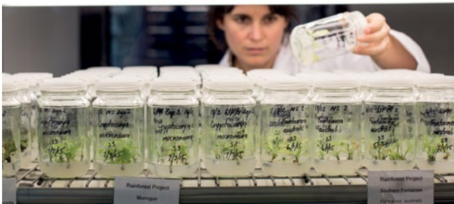
Growing endemic species at Illawarra Metallurgical Coal, Australia.