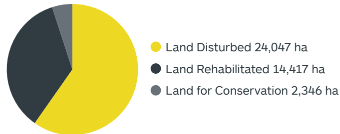
FIGURE 1: South32 land owned, leased or managed.

The Intergovernmental Panel on Climate Change (IPCC) is the international body designated by the United Nations to assess and communicate the science related to climate change.