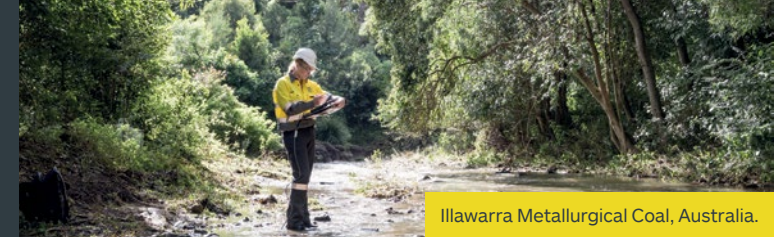
Illawarra Metallurgical Coal, Australia.