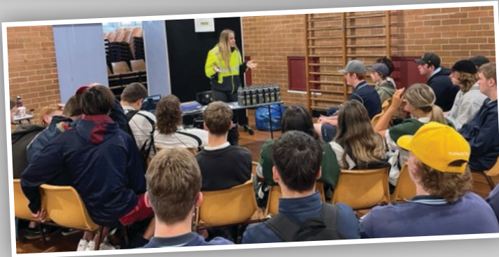
South32 speaks to local students at Dapto High School.

Illawarra Metallurgical Coal had the pleasure of hosting a group of Indigenous students at our Cordeaux Colliery this September. The day included a full site tour, hands-on workshops, career talks and Q&A sessions. The visit formed part of a 2-week course that helps candidates prepare for South32's 2023 apprenticeship intake through HVTC.