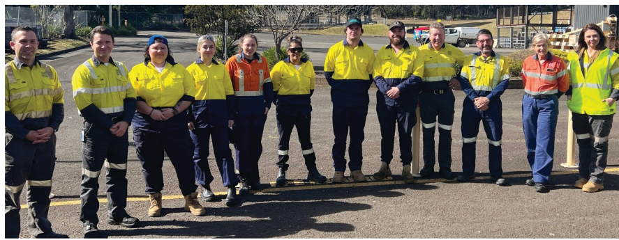
Indigenous students visit Cordeaux Colliery.