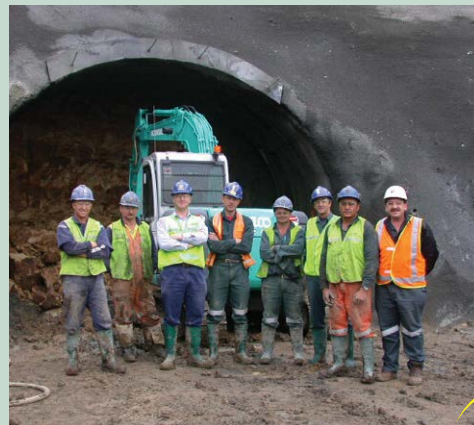
Then: First metre advanced underground at Dendrobium Mine, May 2002

This is a significant milestone, and we would like to thank the communities of Mount Kembla, Kembla Heights, Unanderra and surrounds for their ongoing support.