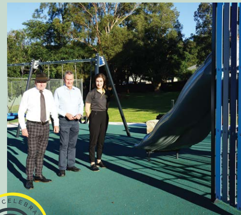
Now: Opening of a Dendrobium Community Enhancement Committee Project - Ryan Park Playground with Wollongong City Council