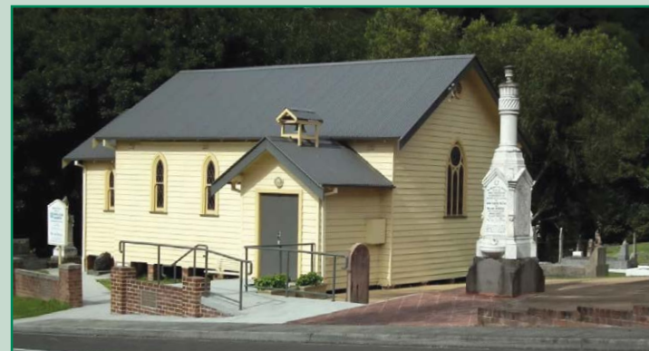
Mount Kembla Miners and Soldiers Church window restoration

Please contact us on 1800 102 210 or email illawarracommunity@south32.net to apply for funding or more information.