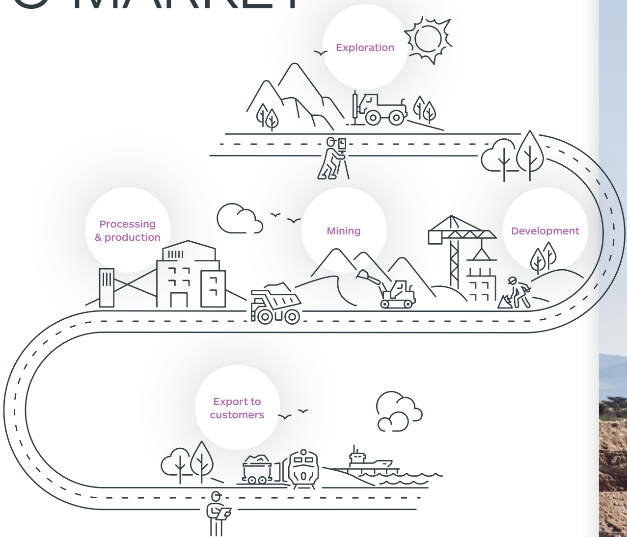
Diagram 1. Mine to Market Chain