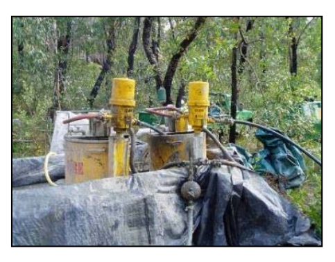
(b) Grout pump station setup