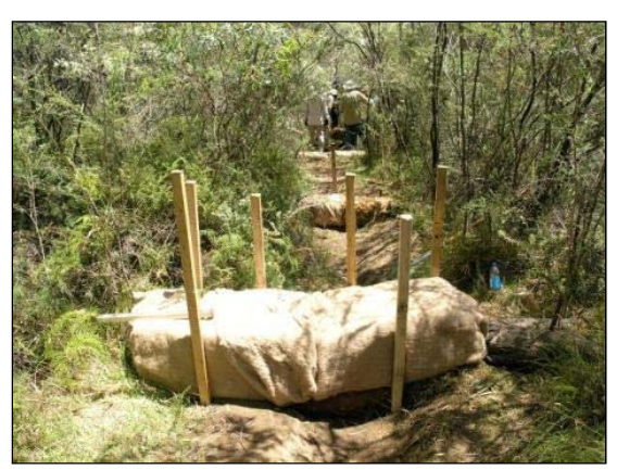
Figure 4-5 Small Coir Log Dams with Fibre Matting

The coir log dams are constructed at intervals down the eroding flow line, the intervals being calculated on the depth of erosion and predicted peak flows and added to until the pooled water behind the 'dams' is at or above the level of the bank of the erosion. Where increased filtering of flows is required the coir logs are wrapped in fibre matting ( Figure 4-5 ).