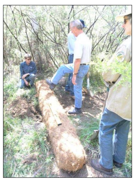
Figure 4-6 Round Coir Logs Installed to Spread Water

Where sheet and rill erosion forms, these processes can reduce vegetation on the surface and/or be a precursor to the formation of gully and stream channel erosion. Treatment of these areas can prevent the formation of channels and maintain swamp moisture. The treatment proposed includes water spreading techniques, involving long lengths of coir logs and hessian 'sausages' linked together across the contour such that water flow builds up behind them and slowly seeps through the water spreaders.