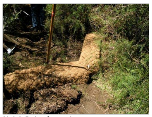
Figure 4-2 Square Coir Logs for Knick Point Control

Erosion can occur along preferred flow paths where subsidence induced tilts increase a catchment area. To arrest this type of erosion, 'coir log dams' are installed at knick points in the channelised flow paths or at the inception of tunnel/void spaces ( Figure 4-2 ).