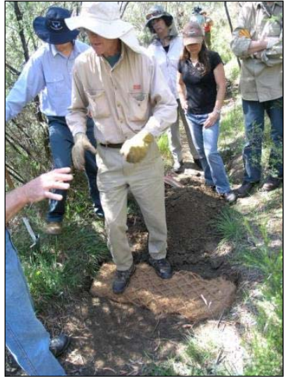
Figure 4-4 Trenching and Positioning of the First Layer of Coir Logs and Construction of a Small Dam in a Channel

The coir log dams are constructed at intervals down the eroding flow line, the intervals being calculated on the depth of erosion and predicted peak flows and added to until the pooled water behind the 'dams' is at or above the level of the bank of the erosion. Where increased filtering of flows is required the coir logs are wrapped in fibre matting ( Figure 4-5 ).