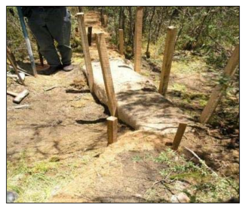
Figure 4-3 Installation of Square Coir Logs

The most important aspect of these coir dams is the positioning of the first layer of coir logs. A trench is cut into the soil so the first layer sits on the underlying substrate so the top of the first coir log is at ground level ( Figure 4-4 ).