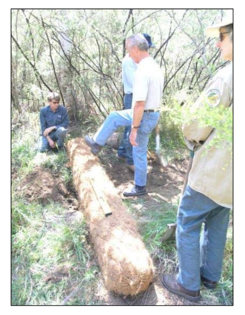
Figure 4-6 Round Coir Logs Installed to Spread Water

Where sheet and rill erosion forms, these processes can reduce vegetation on the surface and/or be a precursor to the formation of gully and stream channel erosion. Treatment of these areas can prevent the formation of channels and maintain swamp moisture. The treatment proposed includes water spreading techniques, involving long lengths of coir logs and hessian 'sausages' linked together across the contour such that water flow builds up behind them and slowly seeps through the water spreaders