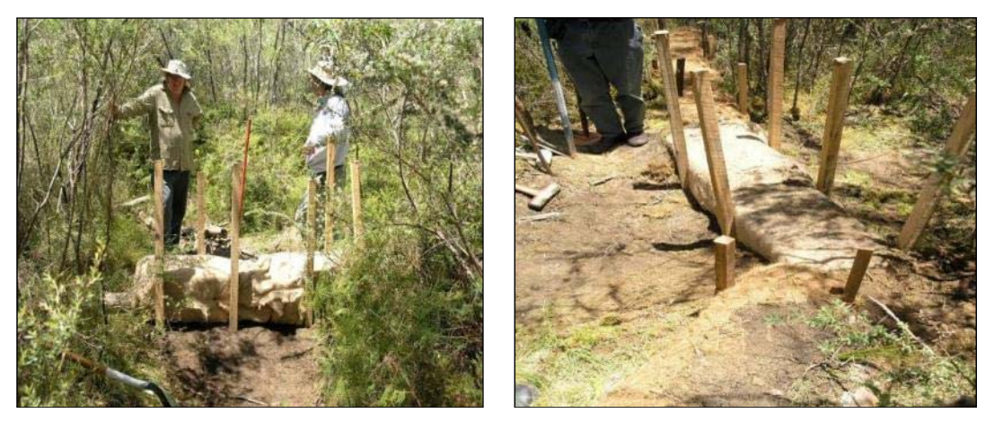
Figure 4-3 Installation of Square Coir Logs

The coir log dam slows the flows in the eroding drainage line such that the drainage line will silt up.