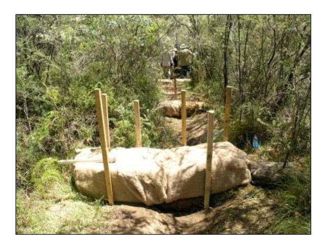
Figure 4-5 Small Coir Log Dams with Fibre Matting