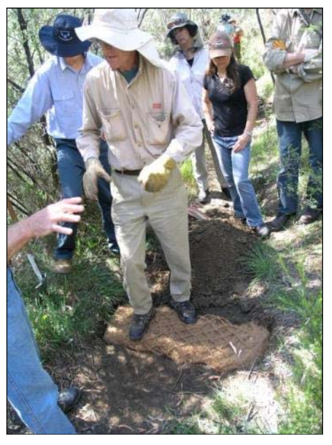
Figure 4-4 Trenching and Positioning of the First Layer of Coir Logs and Construction of a Small Dam in a Channel

The coir log dams are constructed at intervals down the eroding flow line, the intervals being calculated on the depth of erosion and predicted peak flows and added to until the pooled water behind the 'dams' is at or above the level of the bank of the erosion. Where increased filtering of flows is required the coir logs are wrapped in fibre matting ( Figure 4-5 ).