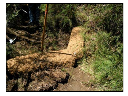
Figure 4-2 Square Coir Logs for Knick Point Control

Erosion can occur along preferred flow paths where subsidence induced tilts increase a catchment area. To arrest this type of erosion, 'coir log dams' are installed at knick points in the channelised flow paths or at the inception of tunnel/void spaces ( Figure 4-2 ).