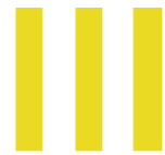
Table 2: Waste Streams - Appin Mine