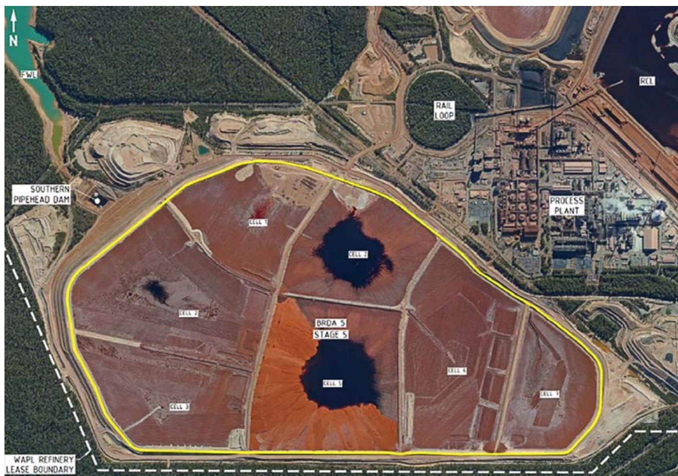
Figure 3: Southern Valley Configuration

Construction of BRDA 5 commenced in 1994, with a starter embankment along the west perimeter. The current configuration of BRDA 5 is displayed in Figure 3.