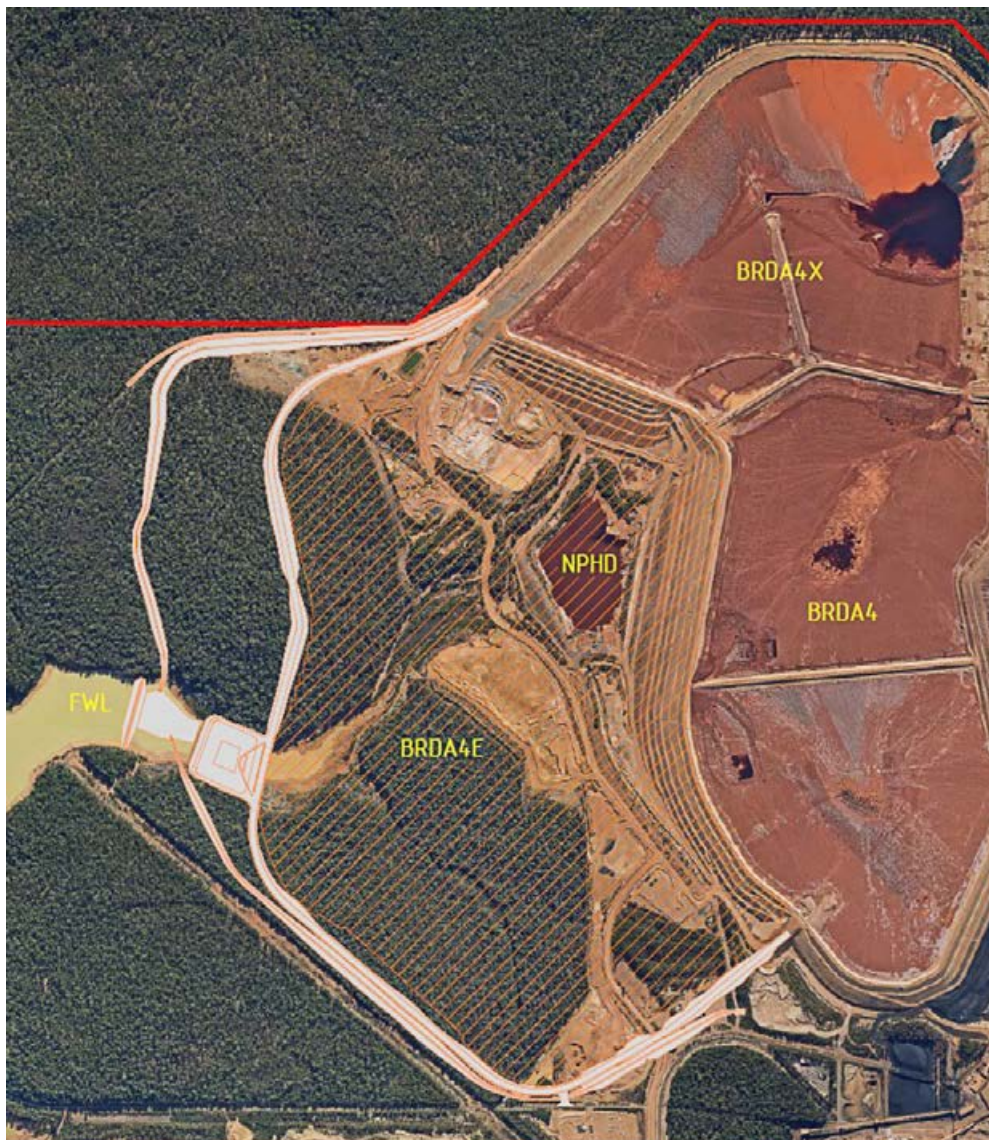
Figure 4: BRDA 4E

A comprehensive site selection process was undertaken for the development of Worsley Alumina's proposed BRDA 4E, which considered the potential impact to the environment, communities, cultural areas, infrastructure and other factors. The preferred site identified was abutting the existing BRDA 4 and 4X embankments. The footprint of the proposed BRDA 4E is shown in Figure 4: BRDA 4E.