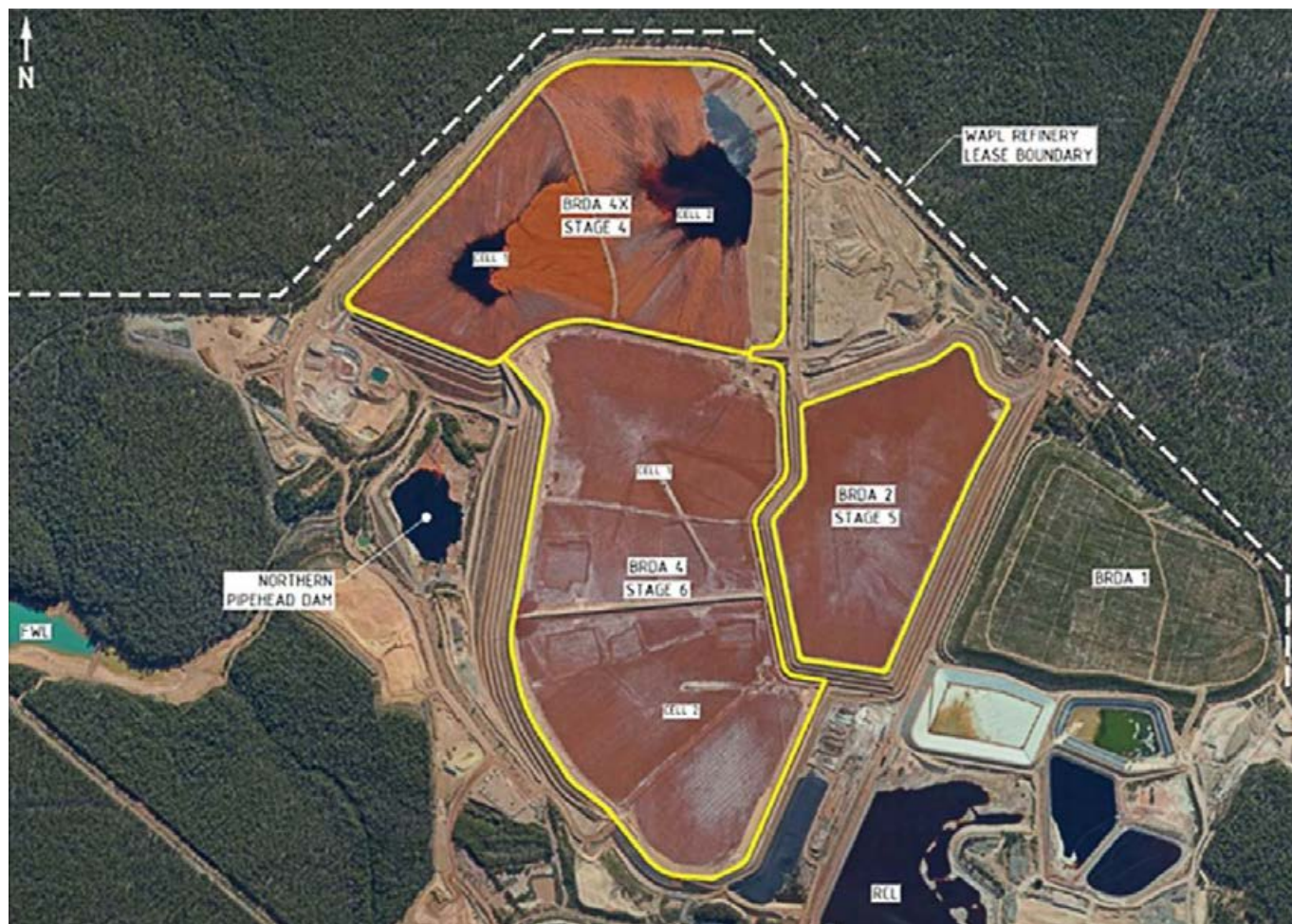
Figure 2: Northern Valley Configuration