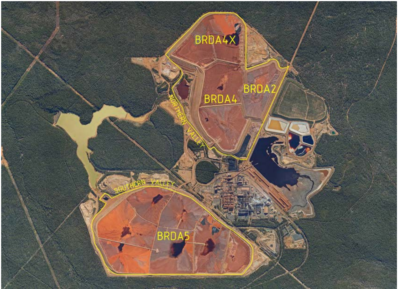
Figure 1: Worsley Alumina Refinery Site Overview

The BRDAs are located on either side of the refinery in two tributary valleys of the Augustus River catchment, referred to as the northern and southern valleys. BRDA 2, BRDA 4 and BRDA 4X are in the Northern Valley and BRDA 5 is in the Southern Valley, as shown in Figure 1, and are the main focus of this disclosure.