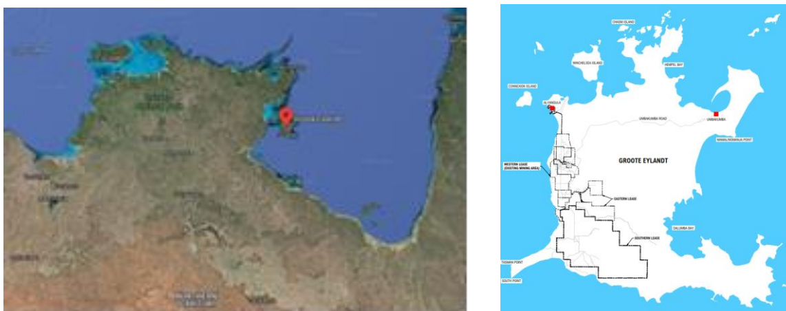
Figure 1: Locality plan GEMCO operation and leases

Groote Eylandt lies about 50 km from the Northern Territory mainland and the eastern coast of Arnhem Land, about 630 kilometres from Darwin. The island measures about 50 kilometres from east to west and 60 kilometres from north to south, with an area of approximately 2,326 km 2 . It is generally quite low-lying, with an average height above sea level of 15 metres, although Central Hill reaches an elevation of 219 metres. Groote Eylandt Mining Company (GEMCO) hold several mining and exploration leases located along the western and southern side of the island.