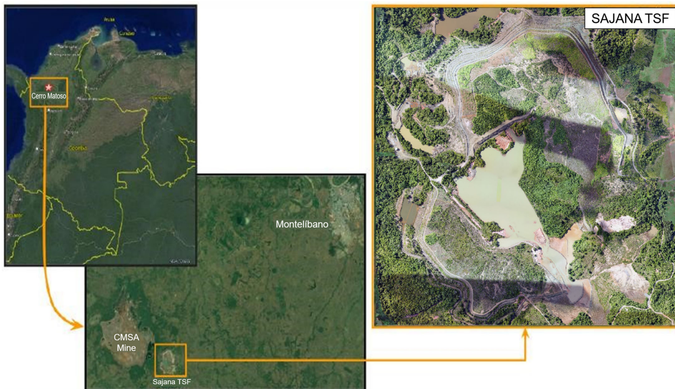
Figure 1: Sajana TSF Location

The Cerro Matoso S.A. (CMSA) mining complex is located in the north-west of Colombia, approximately 22 km southwest of Montelíbano in the province of Córdoba. The Sajana TSF is located 5 km from the mine on the south-eastern side, as shown in Figure 1.