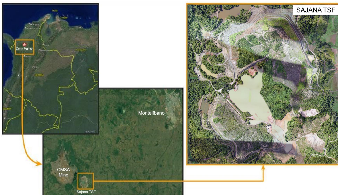
Figure 1: Sajana TSF Location

The Cerro Matoso S.A. (CMSA) mining complex is located in the north-west of Colombia, approximately 22 km southwest of Montelíbano in the province of Córdoba. The Sajana TSF is located 5 km from the mine on the south-eastern side, as shown in figure 1.