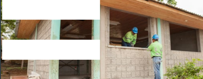
Building homes for the community at Cerro Matoso, Colombia.