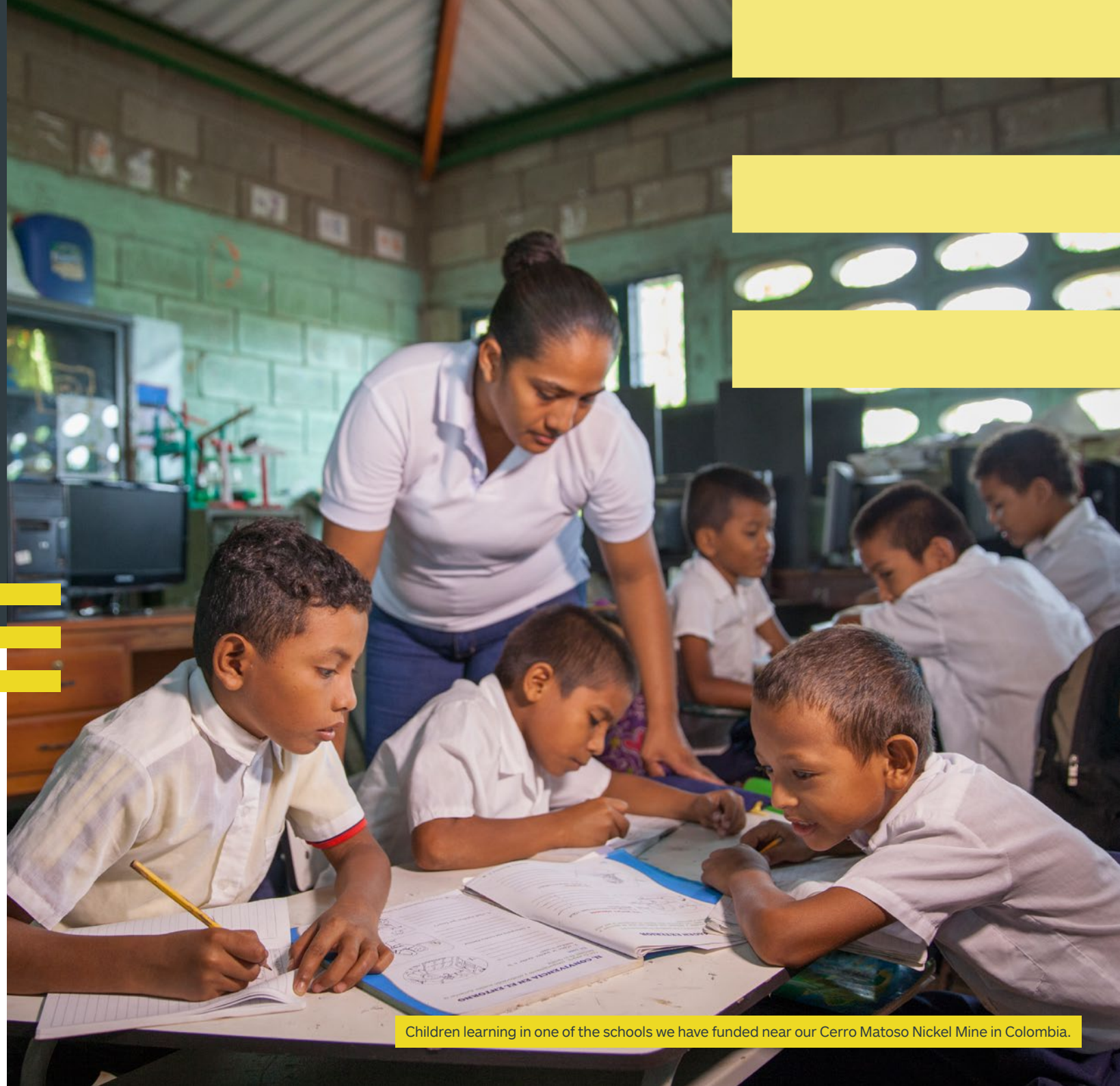
Children learning in one of the schools we have funded near our Cerro Matoso Nickel Mine in Colombia.