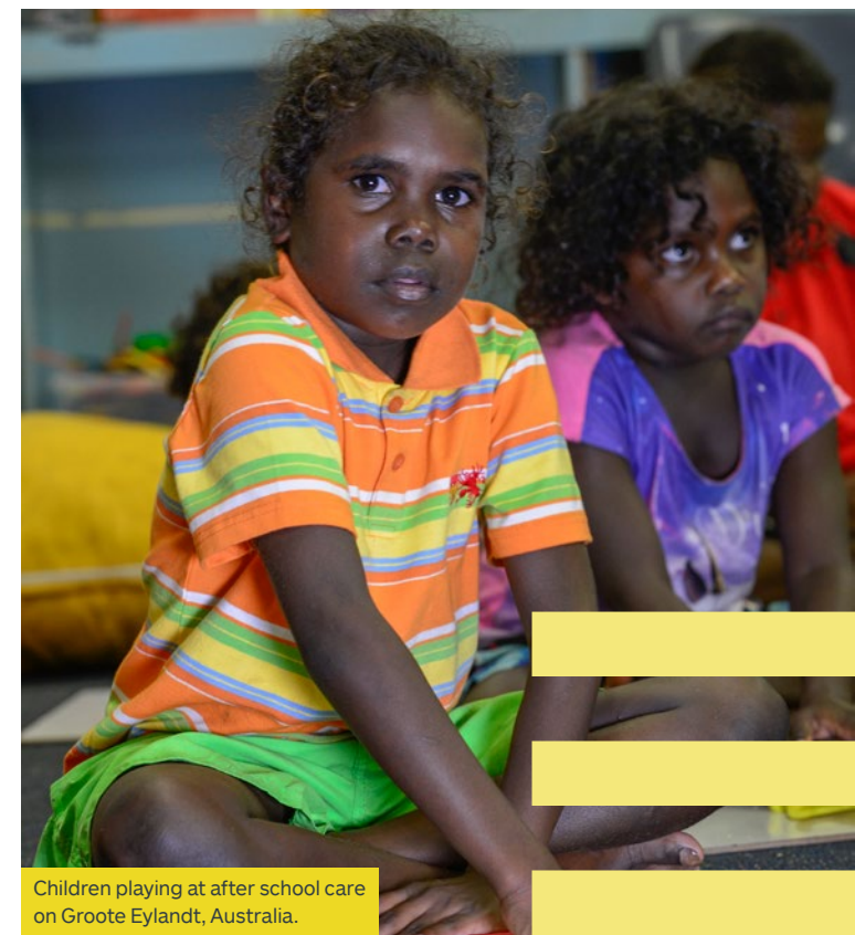
Children playing at after school care on Groote Eylandt, Australia.

In the Australia Region we received 114 complaints, with the greatest number related to noise, primarily from trains transporting product in the Illawarra region (49 complaints). The number of complaints is fewer than last year, however we will continue to work on minimising our impacts. Other complaints included concerns about impacts on private property, structures and visual impacts.