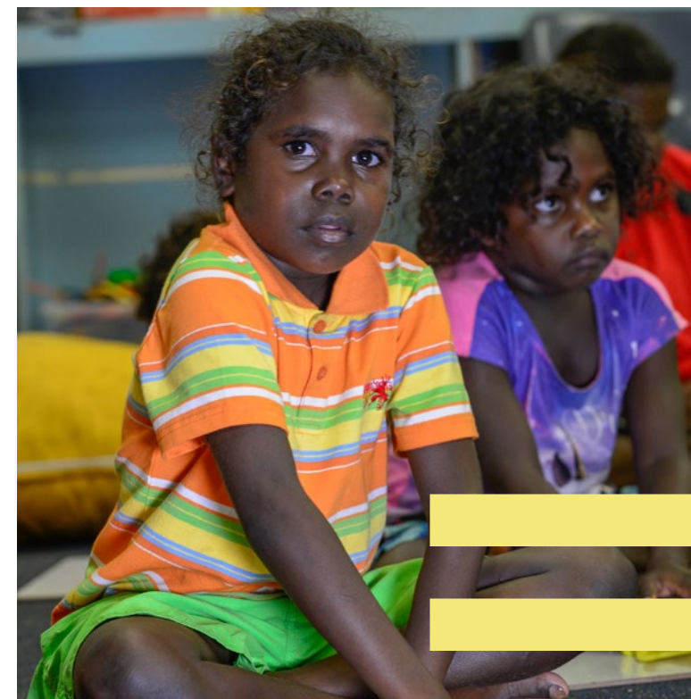
Children playing at after school care on Groote Eylandt, Australia.

In the Australia Region we received 114 complaints, with the greatest number related to noise, primarily from trains transporting product in the Illawarra region (49 complaints). The number of complaints is fewer than last year, however we will continue to work on minimising our impacts. Other complaints included concerns about impacts on private property, structures and visual impacts.