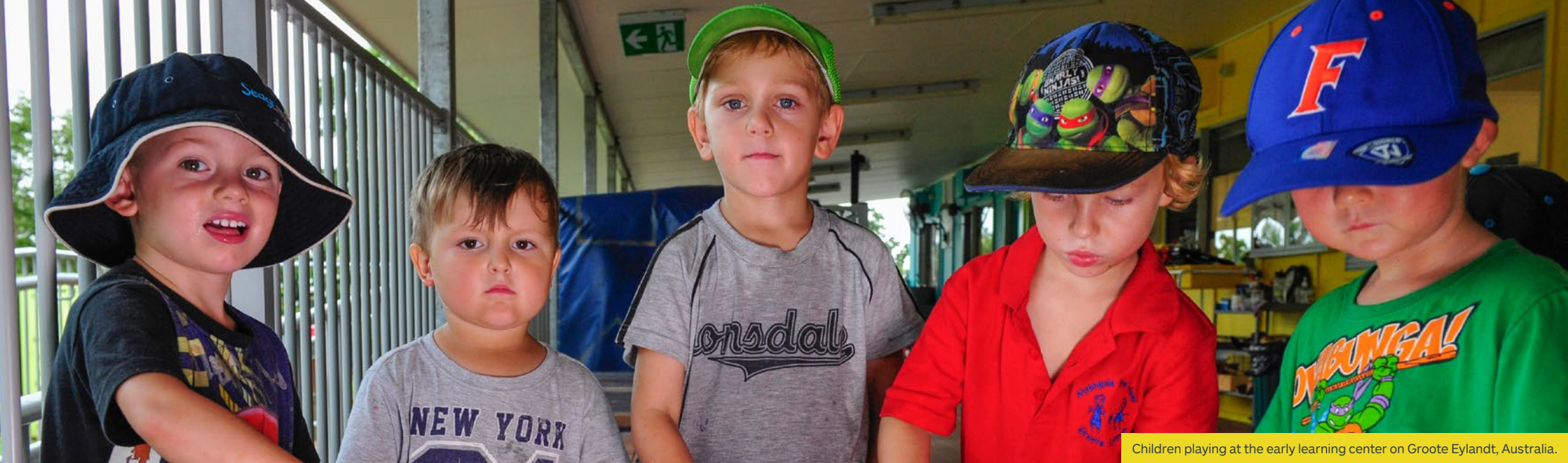
Children playing at the early learning center on Groote Eylandt, Australia.